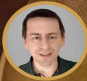
John M. Jumper